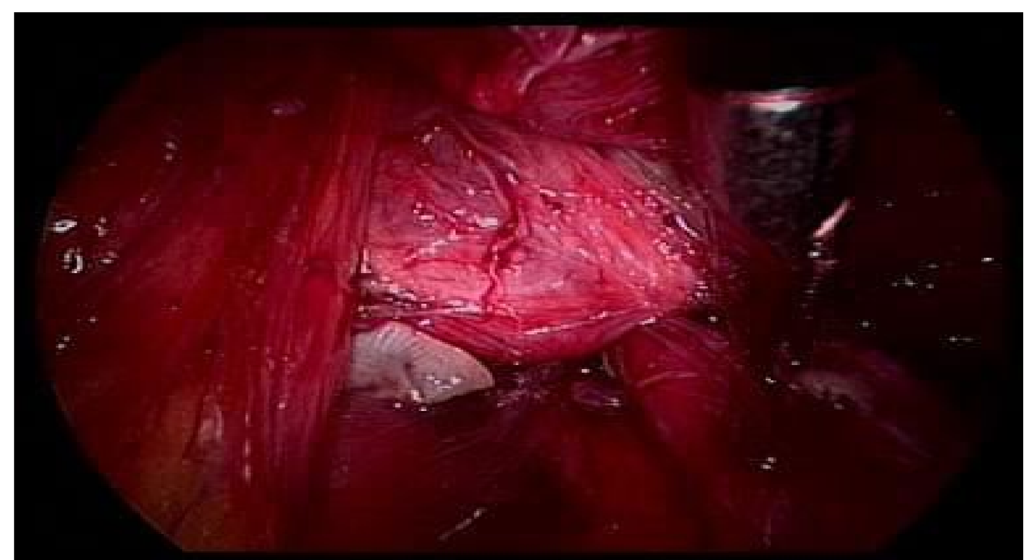
MASS OF THE BROAD LIGAMENT